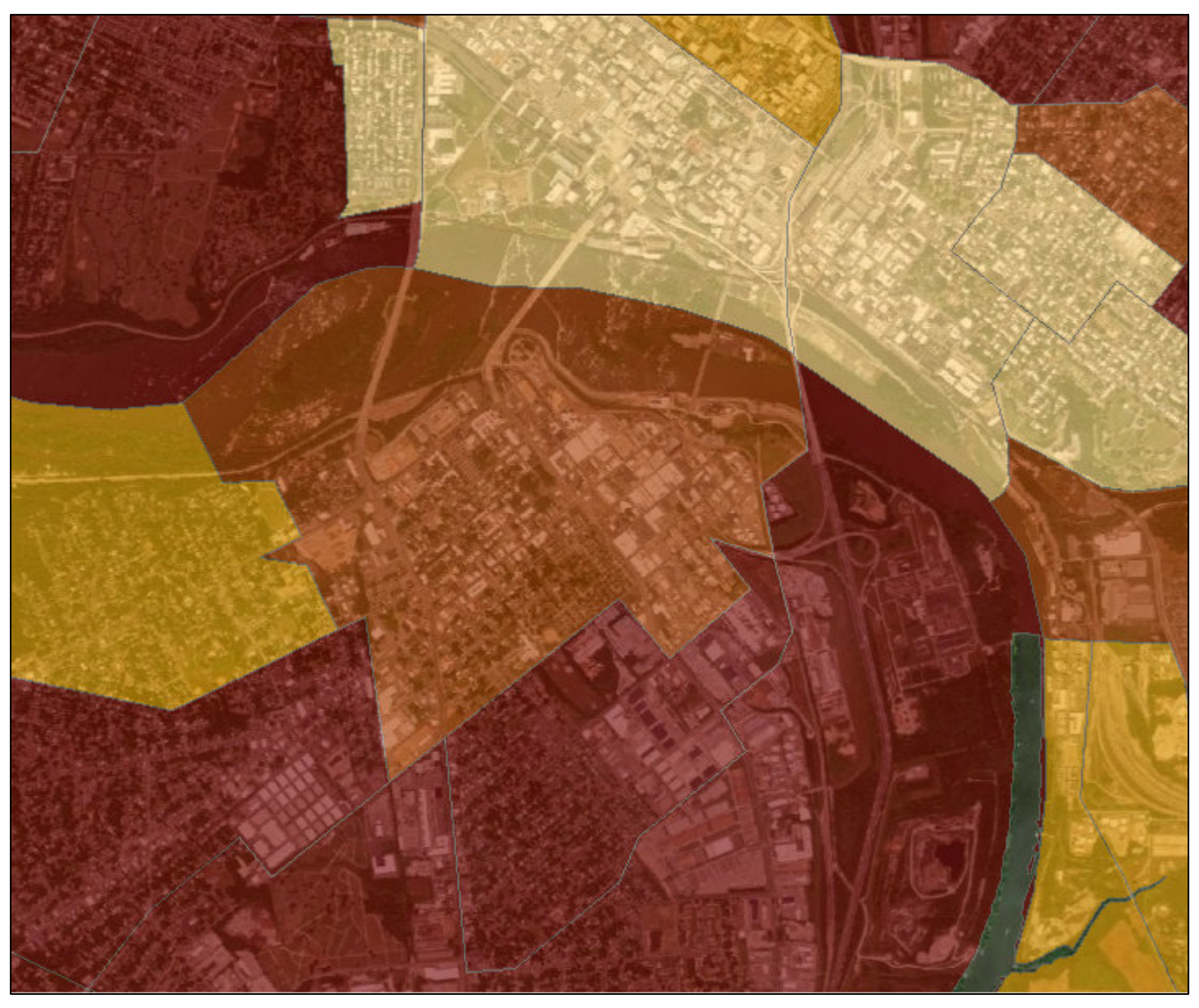
September 1, 2021