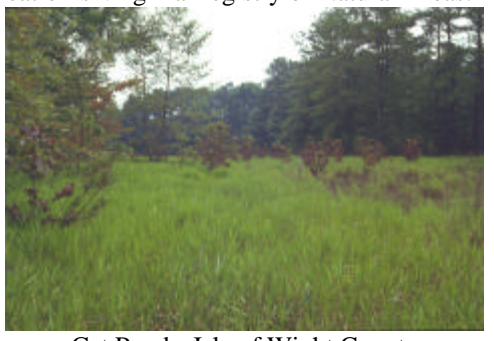
Cat Ponds, Isle of Wight County

Cat Ponds in Isle of Wight County has 14 rare species and communities including one rare natural community, seven rare plant species, a rare damselfly, four rare amphibians, and the state endangered chicken turtle. The landowner has been awarded a plaque and certificate for placing his property on the Department of Conservation and Recreation's Virginia Registry of Natural Areas.