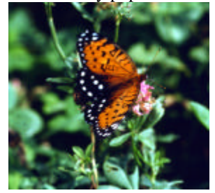
Regal fritillary (Speyeria idalia) (G3/S1)

zoologists are in communication with the site managers to promote habitat management and monitoring of the butterfly population.