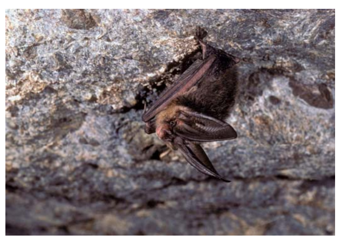
A Virginia Big-eared Bat Hangs Out on the Cave Wall.

The Virginia Big-eared Bat (Corynorhinus townsendii virginianus) may not win any beauty contests, but it is one of the most unique and endangered bat species in North America. It also happens to be the official State Bat of Virginia as designated by a recent legislative gesture by state lawmakers and Governor Mark Warner. Texas is the only other state in the country with a bat designated as an official representative; the Mexican Free-tailed Bat (Tadarida brasiliensis) is the "state flying mammal" of Texas. Oddly enough, this species is rumored to have shown up once or twice in Virginia, blown to the north by powerful hurricane winds.