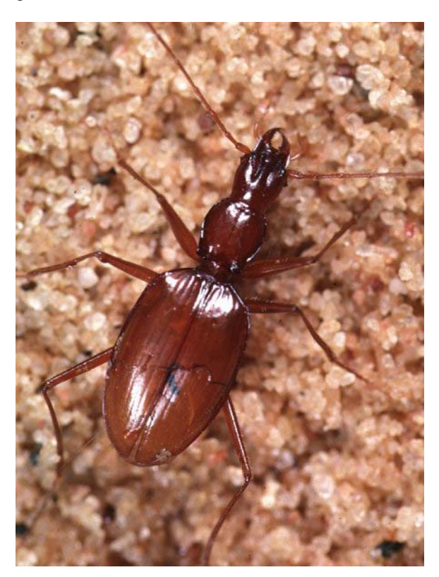
This half centimeter long cave beetle is one of dozens of cave beetle species found in the eastern United States.

In a small cave in Tazewell County, amber colored beetles a few millimeters long scurry back and forth across mudbanks along a small stream. Eyeless and diminished in pigment (see picture), their other heightened senses allow them to navigate the lightless cave environment in search of food, water, shelter, and mates. The Maiden Spring Cave Beetle ( Pseudanophthalmus virginicus ) is known from this single cave and nowhere else. Even more amazingly, this species is not unique in its isolation. Of the more than 39 cave beetle species documented in Virginia, 23 are known from five or fewer locations globally, with an additional seven species known from 20 or fewer locations. Each species is confined to a single cave or small group of nearby caves which may be connected by beetle-sized passages through which human cavers won't fit.