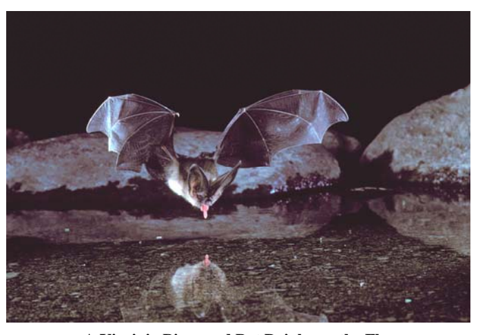
A Virginia Big-eared Bat Drinks on the Fly.

Both male and female Virginia Big-eared Bats typically congregate in large groups for hibernation, but in summer females separate to form maternity colonies whereas males are usually solitary. Females typically give birth to one pup during June. The young pup grows rapidly and can be on the wing in as few as three weeks. They are typically weaned, nearly full grown, and feeding on their own at about seven to eight weeks. Several studies have shown that this bat feeds primarily on moths but may occasionally take other insects such as beetles, flies, and ants during its nocturnal wanderings.