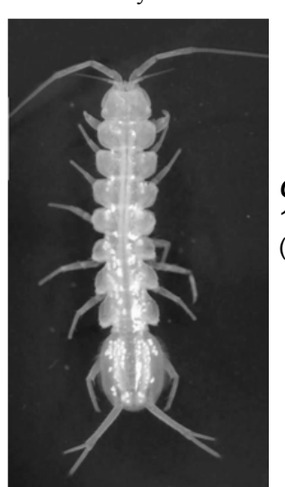
Caecidotea, 10 mm long (photo 1)

For centuries, people have known that there are animals dwelling in caves that lack many of the characteristics and features possessed by their cousins on the surface. Most cave-adapted animals lack both eyes to see and pigment to protect them from solar radiation. The majority of these animals are invertebrates, including insects, crustaceans, spiders, and snails. Most cave-adapted invertebrates have other characteristics that their surface relatives lack, which allow them to thrive underground. These include elongated antennae, bristles over their bodies so they can feel their way around,