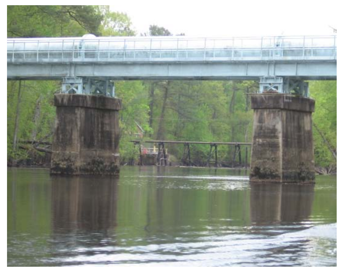
Crossings include road and these pipes