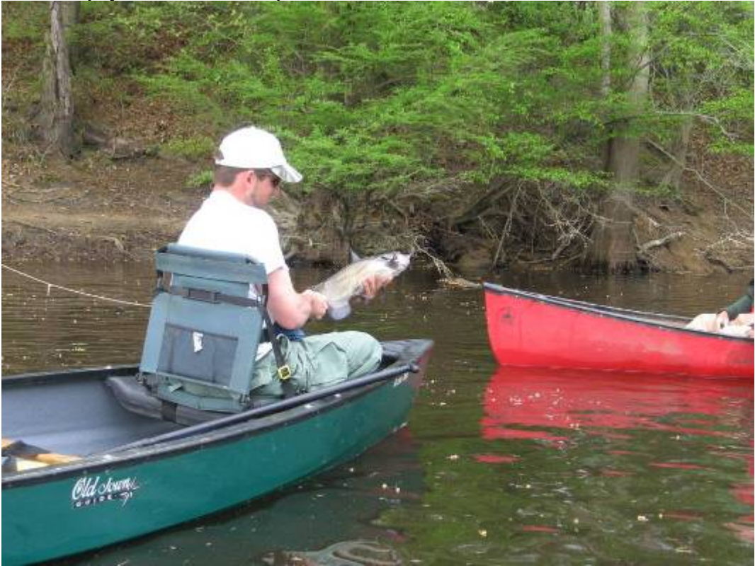
Tied fishing lines are left by locals to catch fish when they are not present

The fisheries rating for the Blackwater River ranges from poor to excellent, depending on the sections. The river hosts runs of striped bass, river herring (alewives and blueback), and American and hickory shad in the spring. Angling for redbreast sunfish ("red throats" or "red robins") is also quite good in the spring. The river also provides habitat for largemouth bass, bluegill, crappie, flier, and chain pickerel populations. Bowfin and gar are common in the lower main stem. Angling for bowfin provides a great opportunity to catch many hard-fighting fish in a short amount of time. The possibility also exists to land a trophy bowfin over ten pounds.