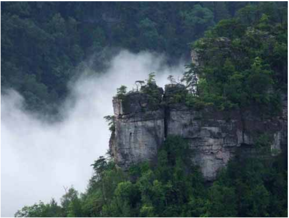
5 Nearby, the mist off the river highlights the gorge Towers and shields them from the river

The landscape is very diverse with striking extremes in topography, varied river sections and unique boulders and landform features. The breadth of views ranges from a tight, closed—in corridor to open vistas. Dam releases and weather pattern shifts add to the uniqueness of this landscape.