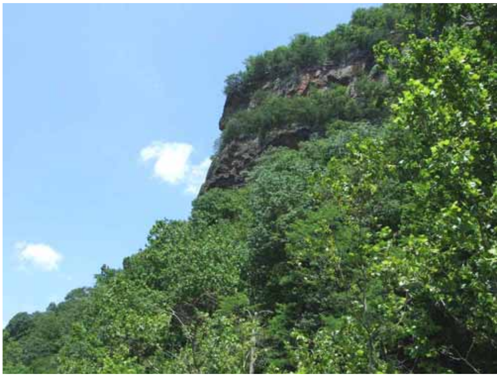
4 Typical rock faces as seen from the river