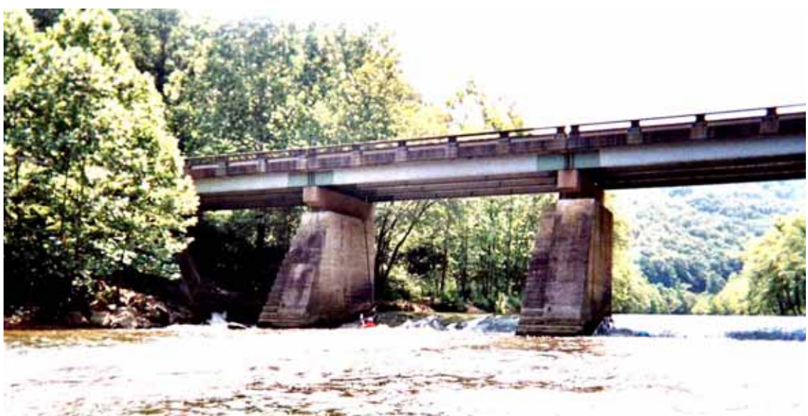
2 The only river modification the splash dam at Bartlick; notice the breached dam section.

The only river flow modification in this section is under the bridge of Route 611 in Bartlick. The riverbed modification is a splash dam, which is a dam built to hold logs floated down from timbering sites upstream until there were are enough logs to transport downstream to market when the river conditions were appropriate. Wooden supports secured in the dam held the logs while letting most of the water through. When the conditions were right, the wooden structure was blown and the logs were then hurtled downstream to waiting sawmills and markets. The splash dam was in place when timbering was a major industry in the area. Once the splash dam was out of use, a section was breached to provide for safe boat passage; thus there is virtually no impoundment of the river. There were not any fallen trees creating blockages or hazards along the study section and there is no channelization.