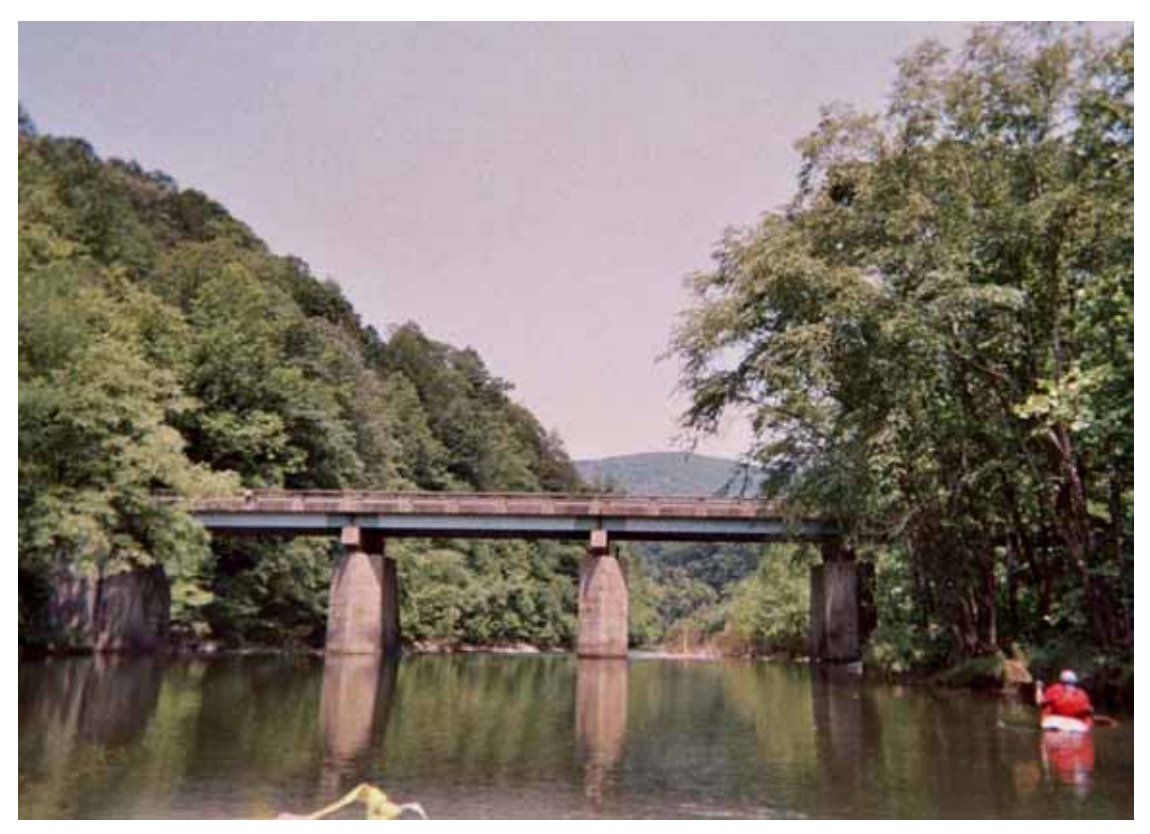
7 Route 611, a scenic byway, at Bartlick