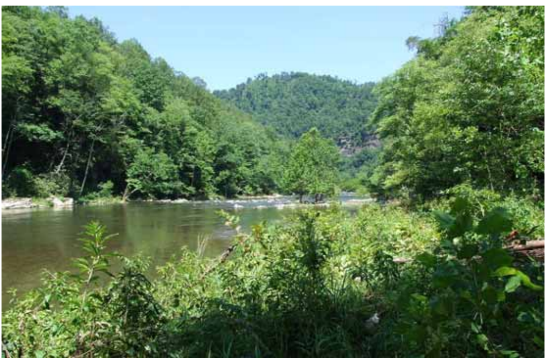
1 Vegetated sand bar with mixed forests on the steep banks beyond

The Russell Fork River charges through a mixed deciduous and hemlock-forested corridor accented by tall cliffs and occasional cobble and sand bars. At the upper elevations of the jagged cliffs of the gorge, the forests are predominantly evergreens. There is no evidence of agriculture along the corridor and ancient quarrying has long been overgrown. A very few short sections have narrow buffers due to parallel railroad tracks or a road.