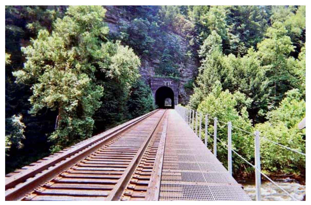
3 Skegg Tunnel – railroad bridge with pedestrian walkway for miners to get to work

There are only a few sites documented by the Department of Historic Resources along this stretch of the Russell Fork. The sites are either not fully studied or not of state or national significance. The valley is, however, rich with coal mining and timbering history and once had a large population. Some of these undocumented sites include the splash dam, abandoned communities, and the train infrastructure that provided access and transportation for workers, goods and services to these remote areas.