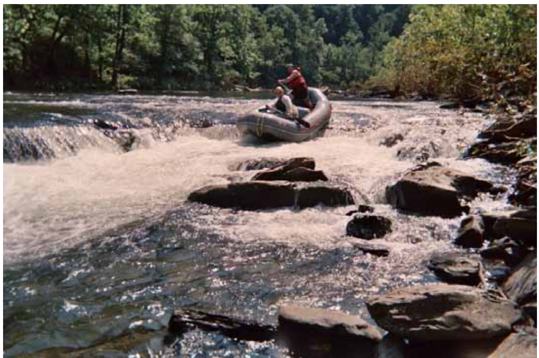
9 Rafting is a popular activity on the Russell Fork River