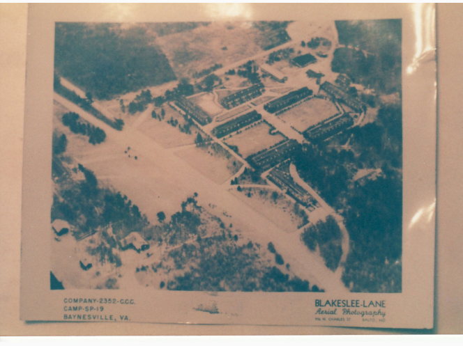
Camp Baynesville #287 in Westmoreland County Virginia