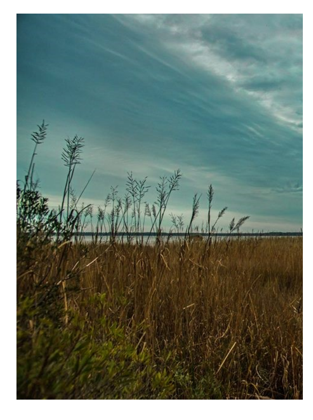
YORK RIVER STATE PARK