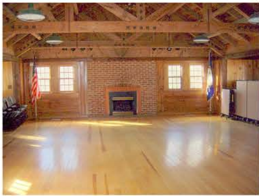
The interior (west end) of Swift Creek Banquet Hall.