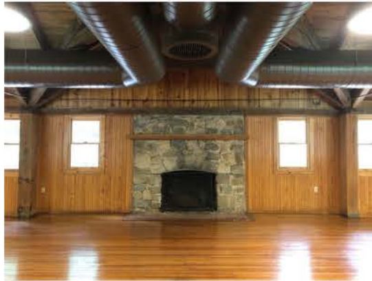
Fireplace inside of Powhatan Banquet Hall.