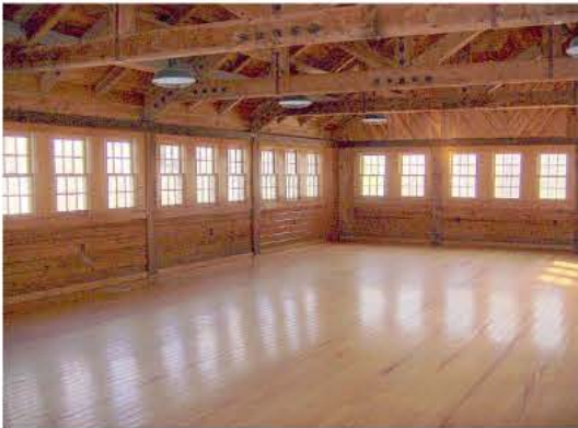
The interior (east end) of Swift Creek Banquet Hall.