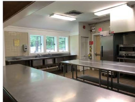
Kitchen view of Powhatan Banquet Hall.