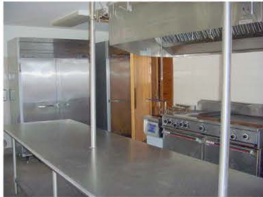
Kitchen – Swift Creek Banquet Hall. Industrial size kitchen appliances are included.

Meeting room Size: Swift Creek 92' X 24' Powhatan 92' X 22'