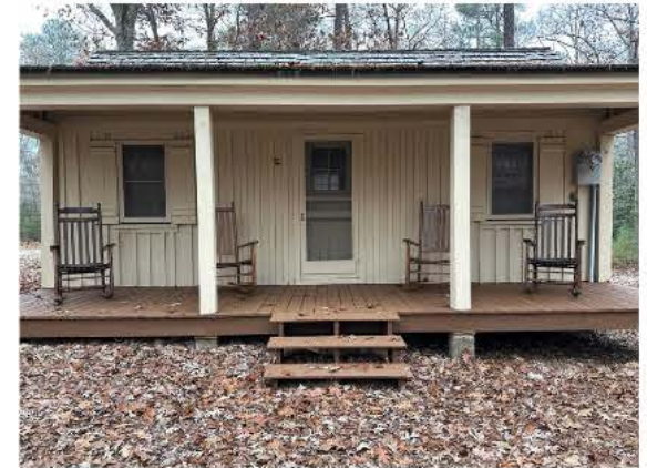
Outside Bride Cabin (Powhatan Only).

If you would like to come view any of these facilities, please be sure to call the State Park Office first for availability.