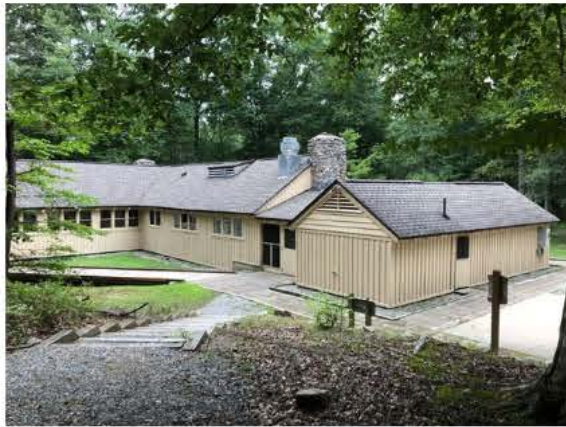
Backside of Powhatan Banquet Hall.

Business Meetings Seminars and Training Events Family Reunions Company Picnics Overnight Retreats Weddings and Banquets