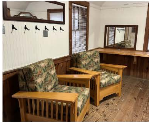
Inside Bride Cabin (Powhatan Only).